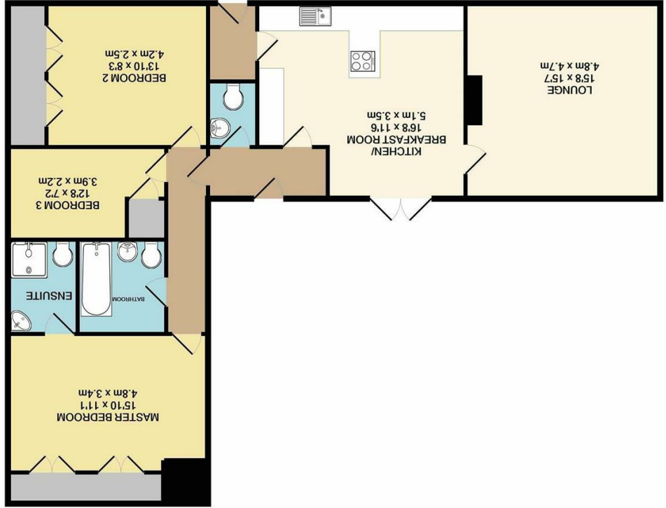
Hempnall Road, Norwich, NR15 Three Bedroom Single Storey Barn Conversion - Guide Price £400,000 - £450,000

TOTAL APPROX. FLOOR AREA 1189 SQ.FT. (110.5 SQ.M.)